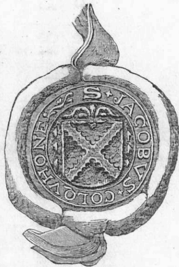
Seal of James Colquhoun of Garscube to deed dated 19 Sept. 1582. (At Buchanan Castle.)